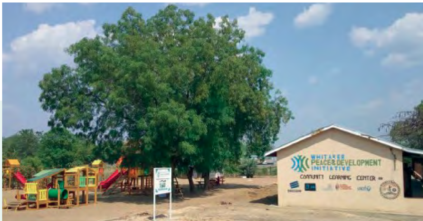
WPDI CLC in Juba

The objective of WPDI establishing the Community Learning Centers (CLCs) is to empower young women and men living in vulnerable and remote places that are almost cut-off from mainstream services, to become peacemakers, leaders and entrepreneurs in their communities. At present, WPDI has 8 fully functioning CLCs with five CLCs in EES in Torit, Lafon, Nimule, Budi and Ikwotos counties, two CLCs in WES in Yambio and Maridi, and one CLC in CES in Juba.