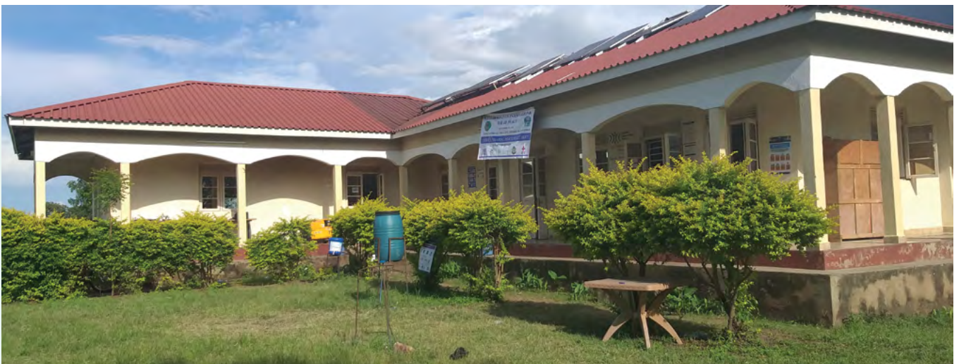
WPDI CLC in Nimule