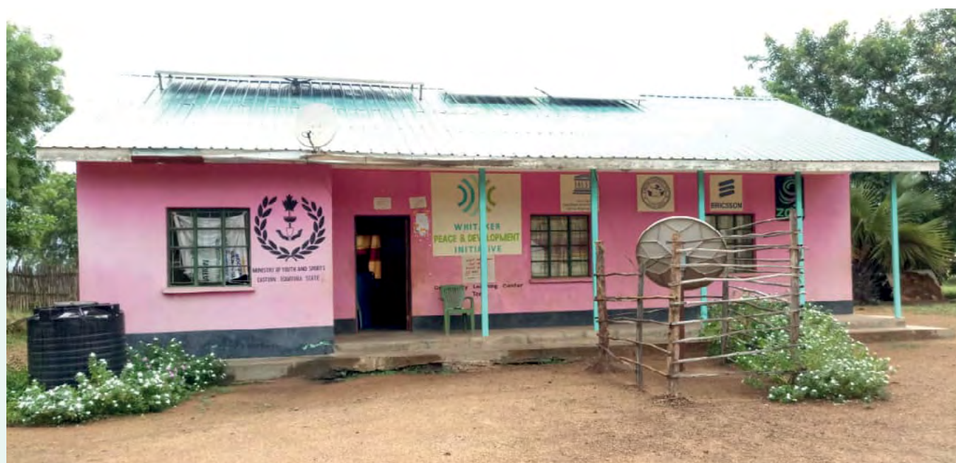
WPDI CLC in Torit