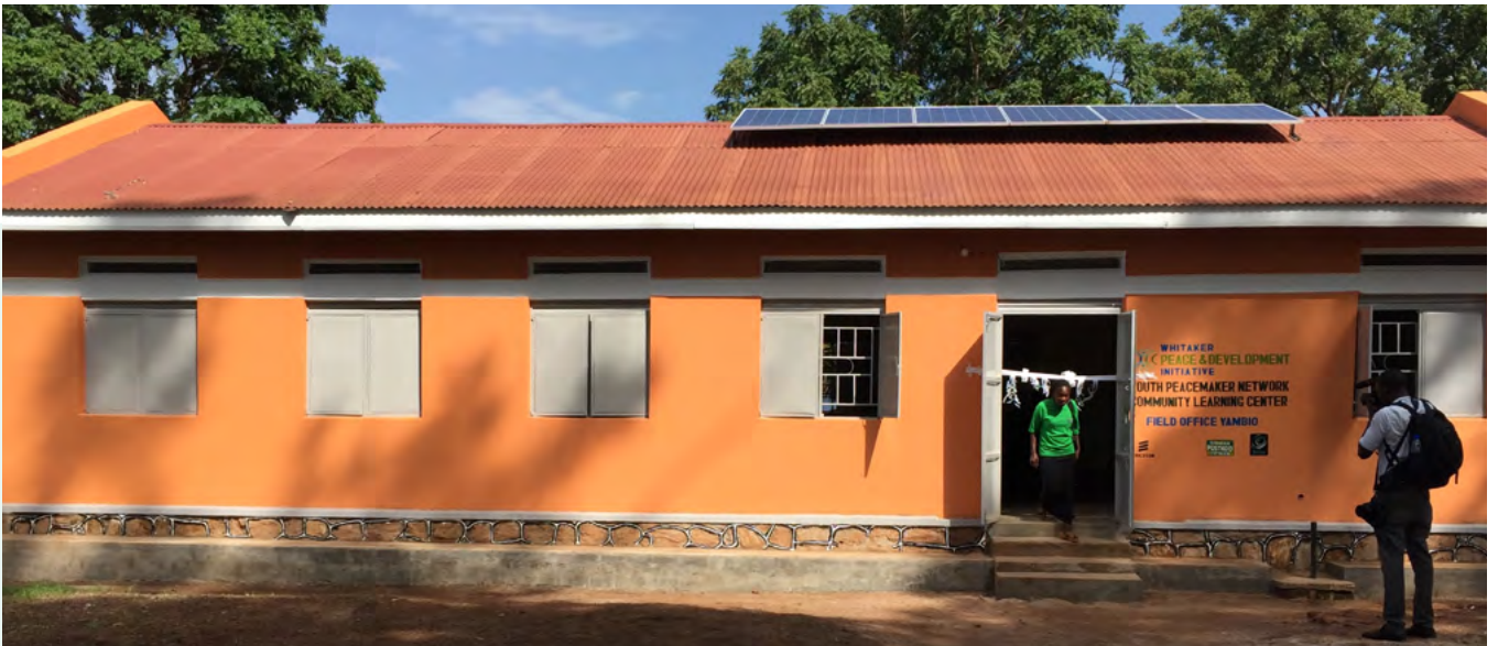
WPDI CLC in Yambio