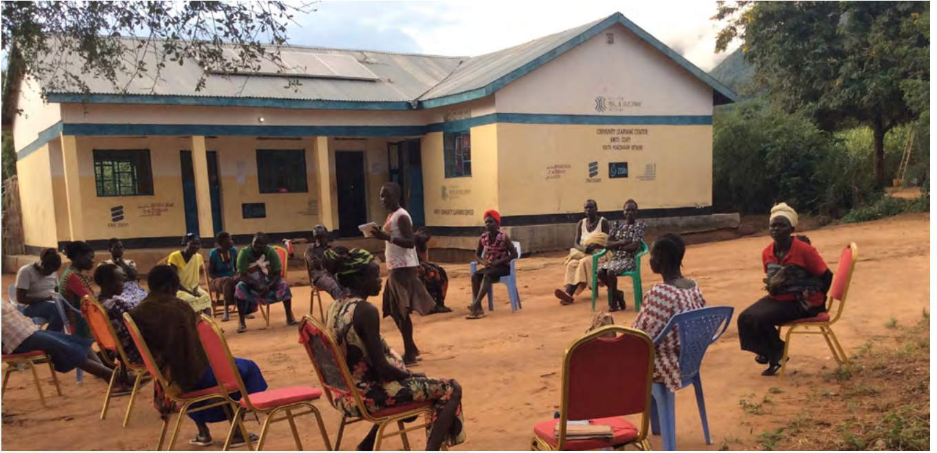
WPDI CLC in Ikwoto