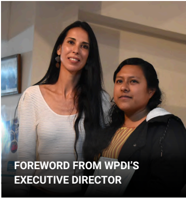
FOREWORD FROM WPDl'S EXECUTIVE DIRECTOR