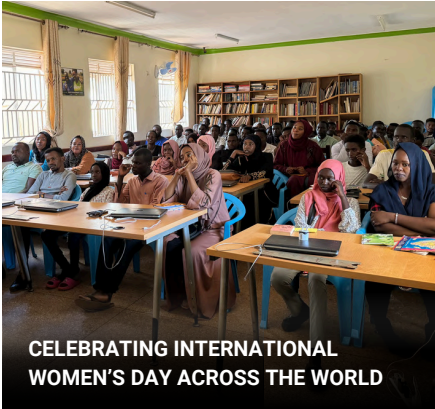
CELEBRATING INTERNATIONAL WOMEN'S DAY ACROSS THE WORLD