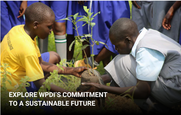
EXPLORE WPDl'S COMMITMENT TO A SUSTAINABLE FUTURE