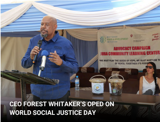
CEO FOREST WHITAKER'S OPED ON WORLD SOCIAL JUSTICE DAY