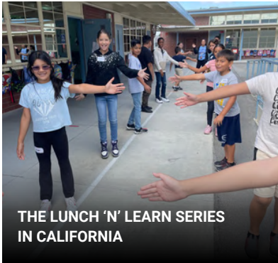
THE LUNCH 'N' LEARN SERIES IN CALIFORNIA